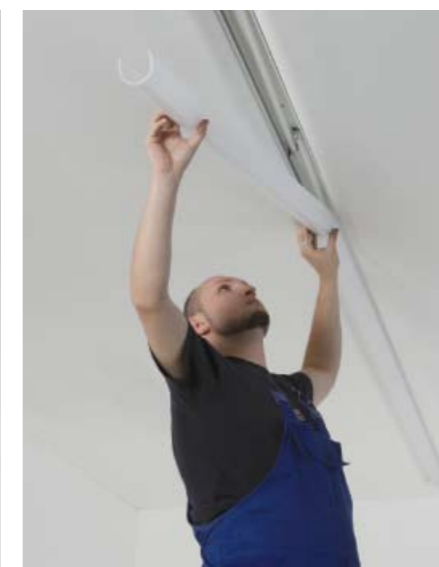
8] The cover is clipped on – finished!