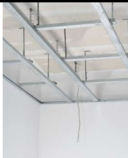
1] The prefabricated gypsum unit is installed in these standard substructures.

Once the joints have been trowelled and the walls or ceilings painted, assembling and wiring the precisely fitting system lights and single lamps is child's play.