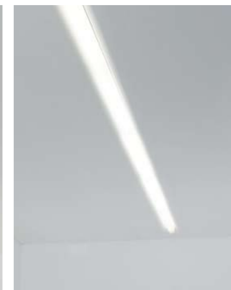
9] Everything from one source: The complete solution saves money and time for efficient installation.