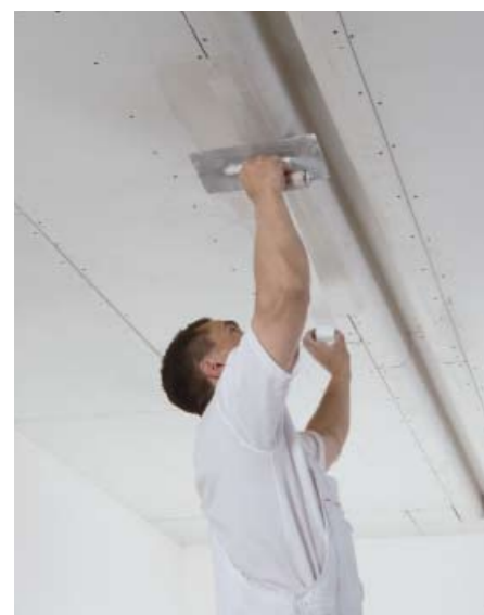
4] The joints are then trowelled...