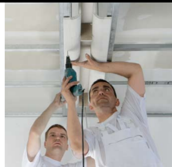
2] Simple, fast and clean: Interior fitters screw the gypsum channel onto the substructure of the gypsum plasterboard ceiling.