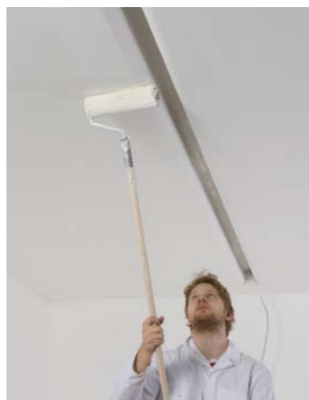
5] ...and the gypsum plasterboard ceiling is painted.