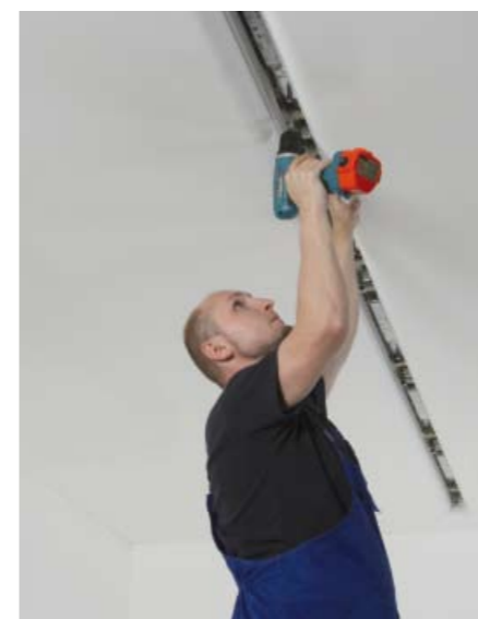
7] ...and subsequently screwed down and wired up.